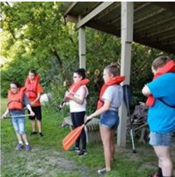
Trinity's YC youth prepare to go canoeing at LOMC